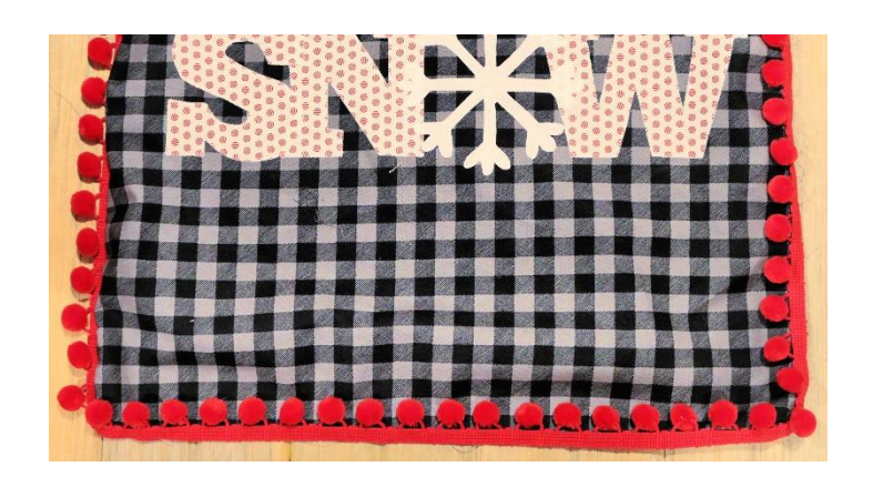
Step 10: Take the Pompom Trim and baste it to the edge of the pillow top.