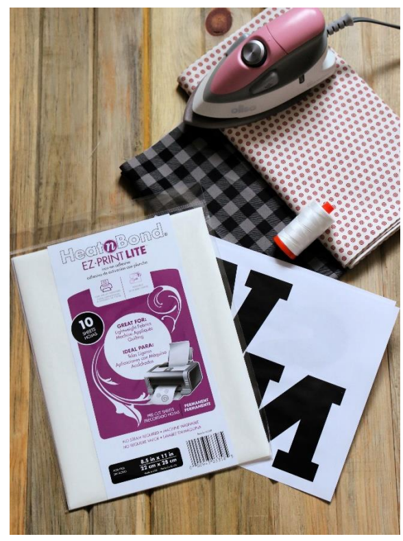
EZ Print HeatNBond Lite Sheets