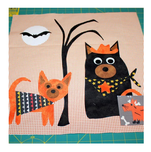
Step 4: Sew around edges using a straight, zig-zag, or blanket stitch.

Step 3: Place applique shapes, adhesive side down, on top of 15\frac{1}{2} " \times 15\frac{1}{2} " center fabric. Press and hold iron for 6 seconds on each section until entire piece is bonded. Let cool.